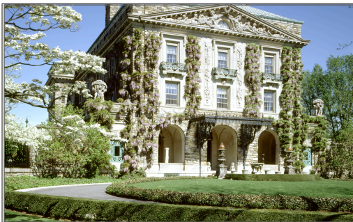
Kukul, the Rockefeller Estate