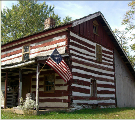
The 1700s Banta Cabin