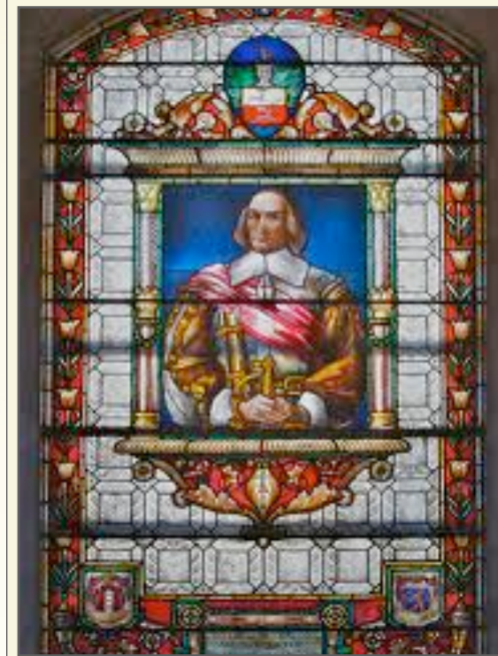
The Holland Window at St. Mark's Church