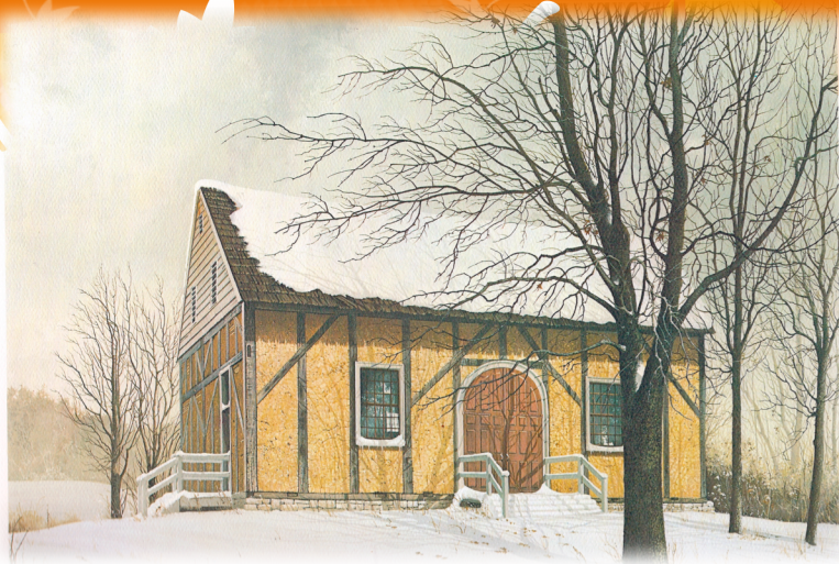
THE OLD MUD MEETINGHOUSE BUILT BY OUR DUTCH REFORMED ANCESTORS IN 1800.

A couple of distant cousins in different states meet through genealogy, compile an email list, put together a message to a group of Low Dutch Descendants that anybody can join, and through small individual donations from these members spread all over the nation, earn enough money to honor & provide markers for Revolutionary Patriots from the Low Dutch Community, who mostly didn't even have gravestones, and then spearhead a concerted effort to save the more-than-two-centuries-Old Mud Dutch Reformed Meetinghouse in Mercer Co., KY, near Harrodsburg, and the group continues to grow & prosper.