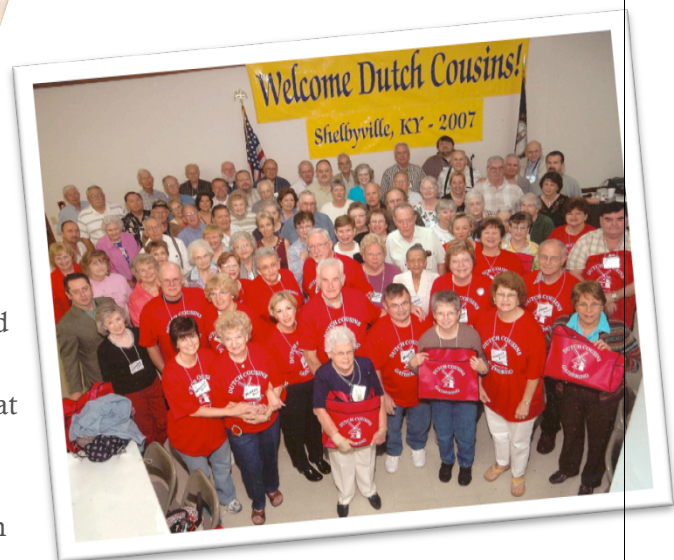
2007 - SHELBYVILLE