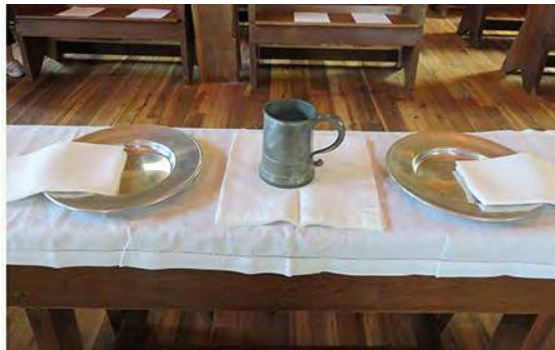
HISTORICAL COMMUNION CUP