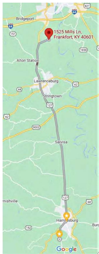
FRANKFORT TO HARRODSBURG