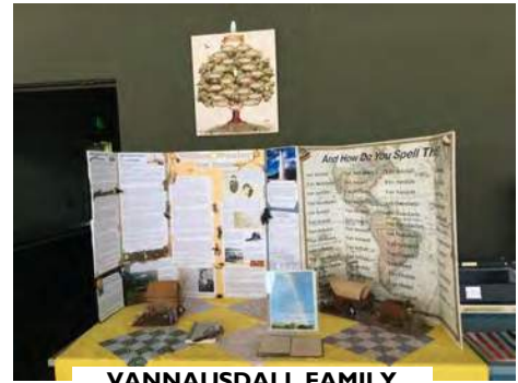
VANNAUSDALL FAMILY DISPLAY

This Is what Dutch Cousin Reunions are all about – collaborating and learning more about family.