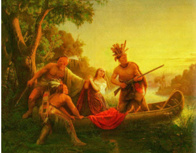
The Abduction of Daniel Boone's Daughter by the Indians by Charles Ferdinand Wimar (1853), depicting a similar abduction in 1776.