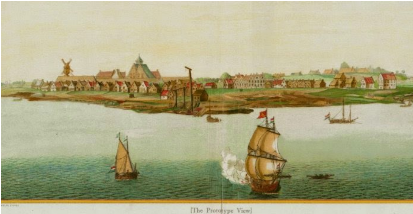
New Amsterdam, circa 1660.